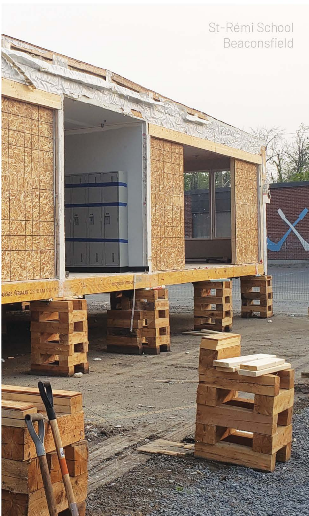
St-Rémi School Beaconsfield