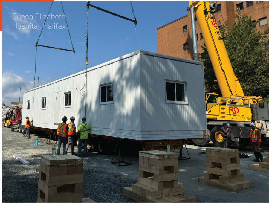
Queen Elizabeth II Hospital, Halifax