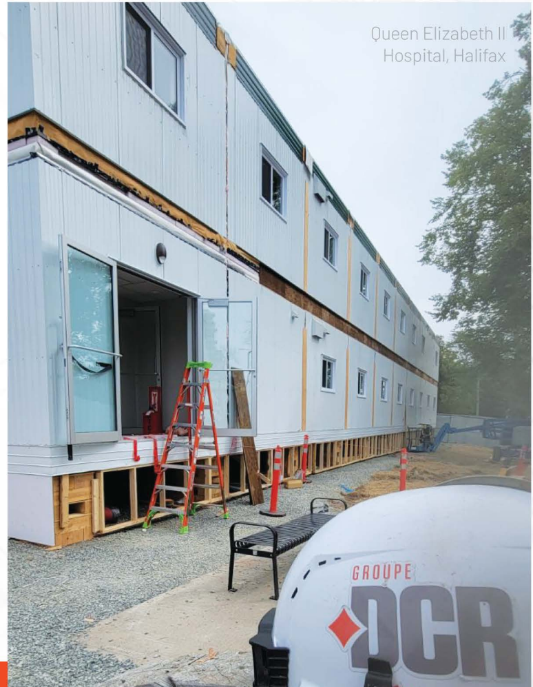
Queen Elizabeth II Hospital, Halifax

Finally, this approach provides great flexibility, with the ability to dismantle and modify certain structures as needs evolve.